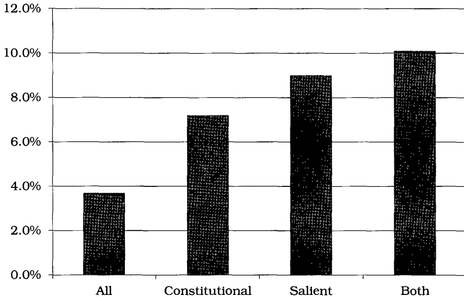
FIGURE 3. CITATION OF PIVOTAL CONCURRENCES BY LOWER COURTS, BY TYPE OF CASE

The empirical data are quite telling regarding the story we have told. The Supreme Court's "norm of acquiescence"—its attempt to function largely as a classic per curiam court—shattered in the face of substantial disagreements following the Progressive Era and into the New Deal. 243 This happened in salient, constitutional cases because that is where the battle was being fought: over the meaning and constraints of the Constitution. And in those cases, the seriatim practice of writing separate opinions signaled, invited, and smoothed the process of constitutional change.